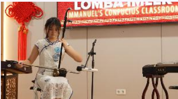
Immanuel Confucius Classroom' CNY Activity

cultural art equipment from the government. The existence of the Confucius Classroom is very helpful for students in Pontianak City in learning Mandarin, Chinese arts and culture. The Confucius Classroom is also very helpful for Immanuel Christian High School to improve the quality of learning Mandarin as a cross-interest option.