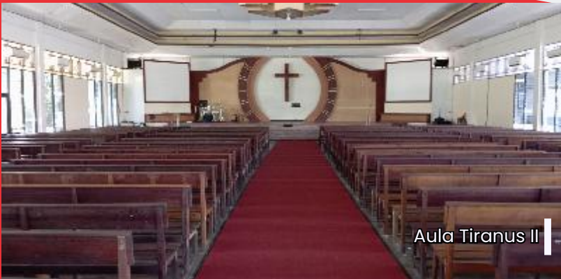
Aula Tiranus II

Beyond the classroom, our facilities empower students to explore their passions and maintain their well-being. With dedicated spaces for music, arts, and professional medical care, we ensure a balanced school life where students can grow safely and creatively.