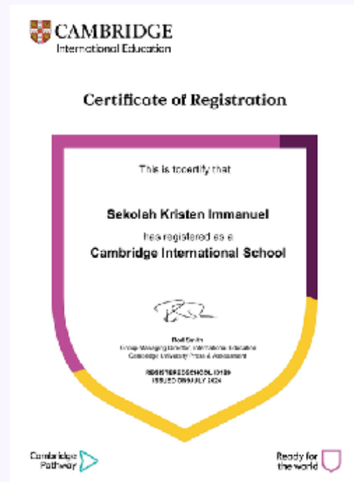
Sertifikat Kerjasama dengan pihak Cambridge

As a commitment of Immanuel Christian High School in improving the quality of national education and International. Cooperation with Cambridge University is one of the targets of Immanuel Christian high school. This collaboration has existed since 2008/2009 as the Centre of Cambridge. Through Centre of Cambridge, Immanuel Christian High school is appointed as a trusted school in Cambridge Test with Cambridge Test certification, students can continue to college in the British Commonwealth, additionally the quality of students will be Acknowledged by various countries.